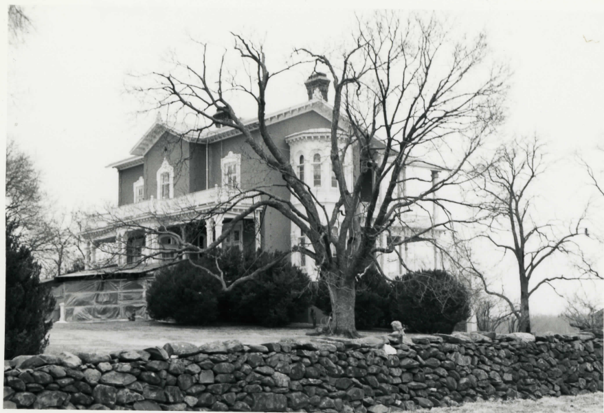
View from Northwest