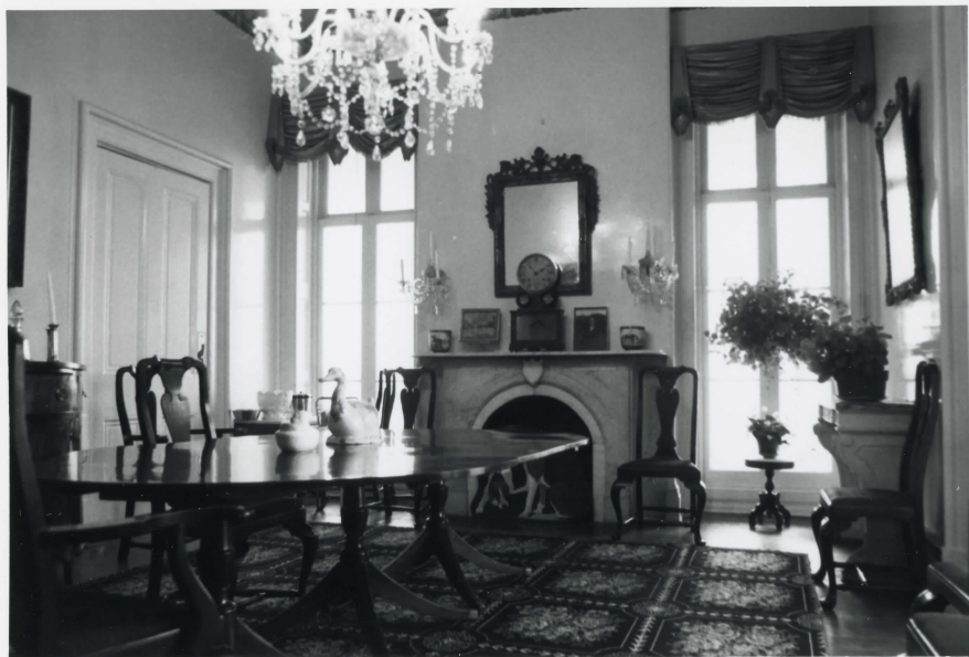
First-Floor South Room (Dining Room) First-Floor East Parlor