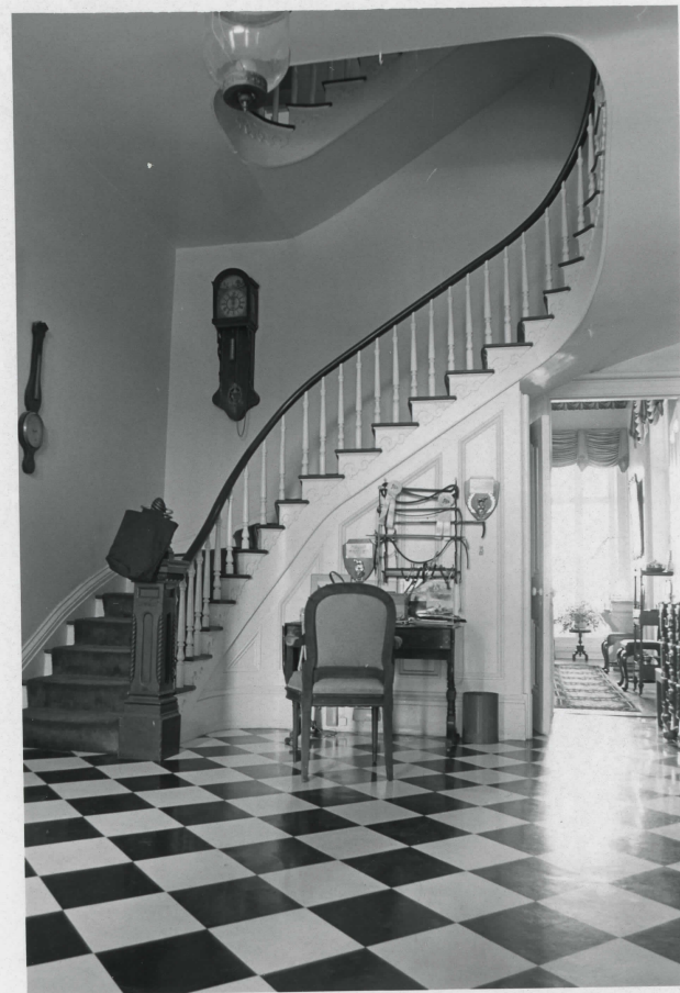
Center Hall, View toward South