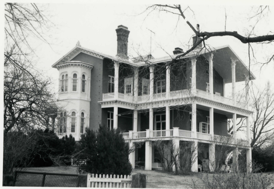
View from Southwest