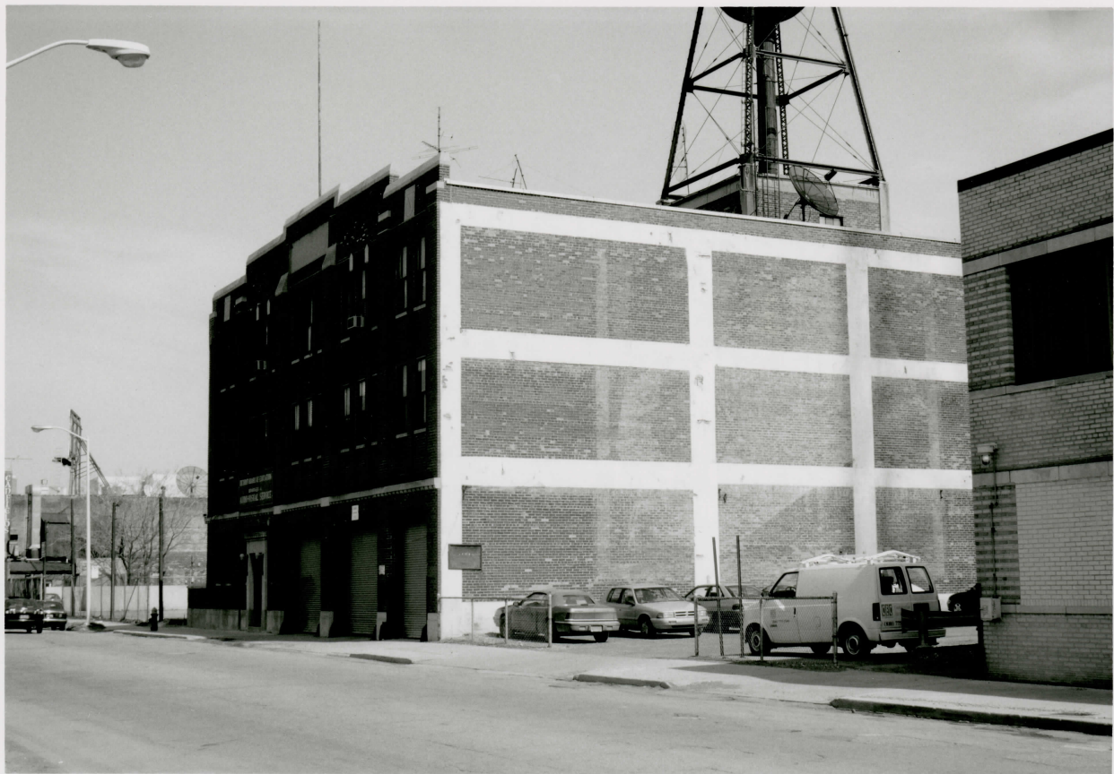
GRAYBAR ELECTRIC CO. BLDG. - DETROIT, WAYNE, MI