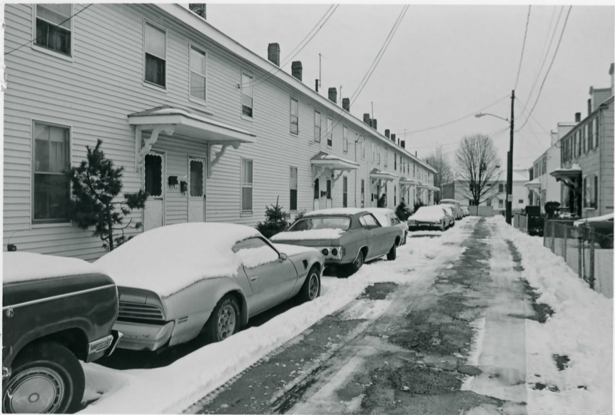
Adwton Place - NORTH SIDE