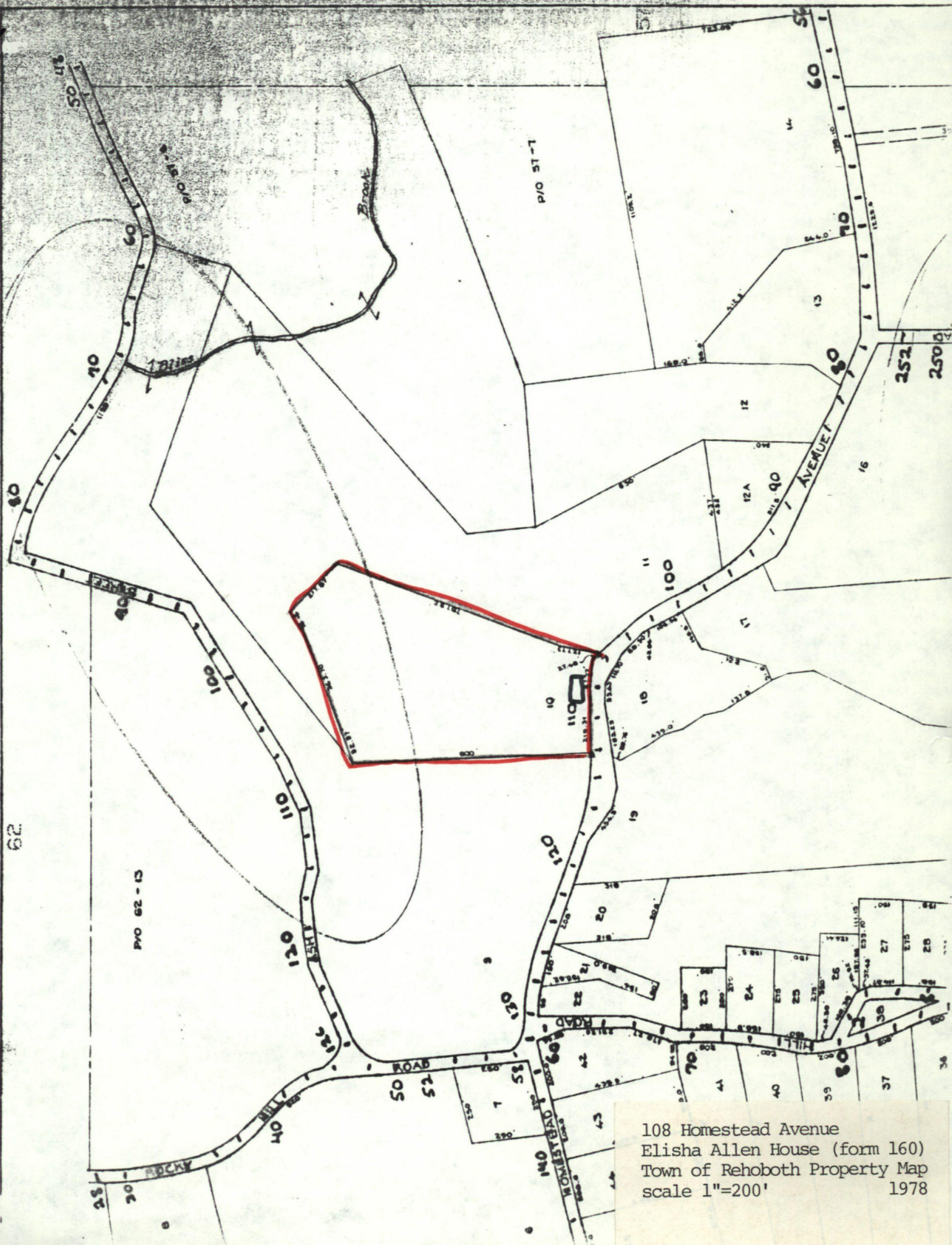
108 Homestead Avenue Elisha Allen House (form 160) Town of Rehoboth Property Map scale 1"=200' 1978