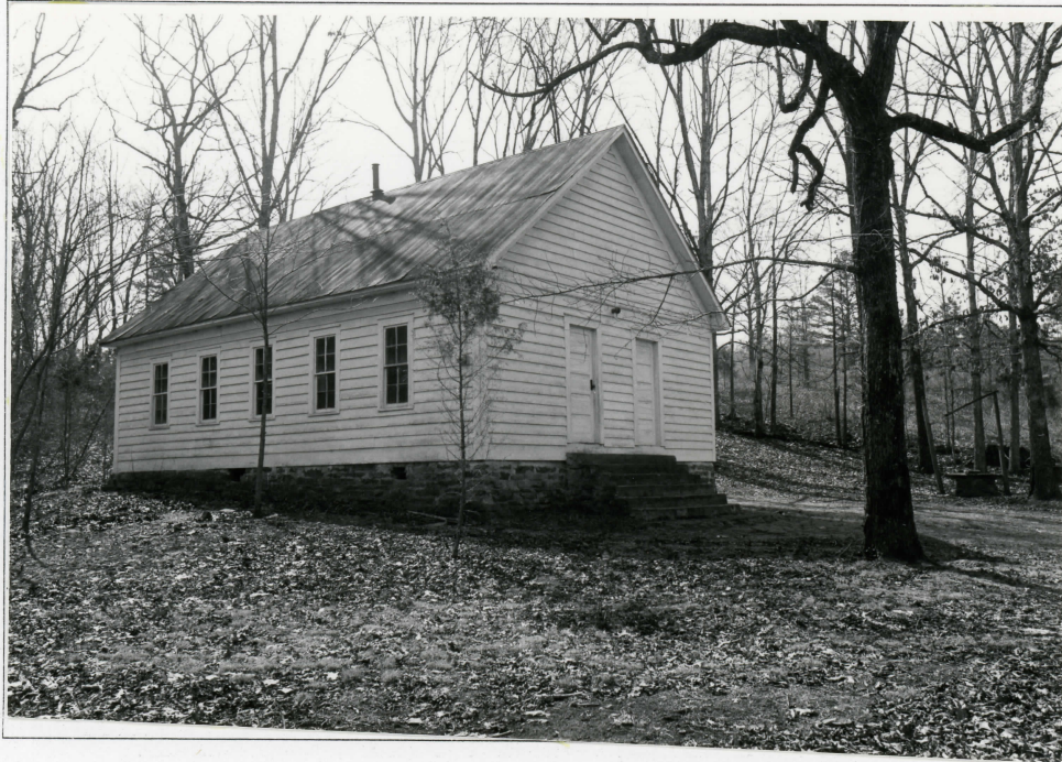
Historic Resources of Stone County Turkey Creek Church & School, ST-142 Turkey Creek 1983 Negative on file at the AHPP Viewed from the northeast