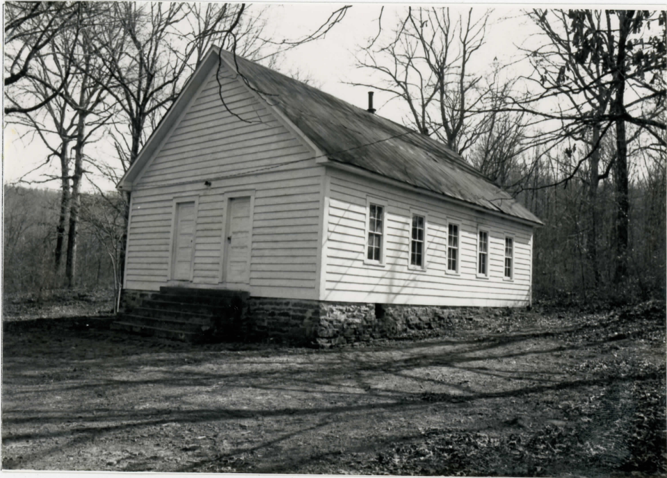
Historic Resources of Stone County Turkey Creek Church & School, ST-142 Turkey Creek 1983 Negative on file at the AHPP Viewed from the northwest