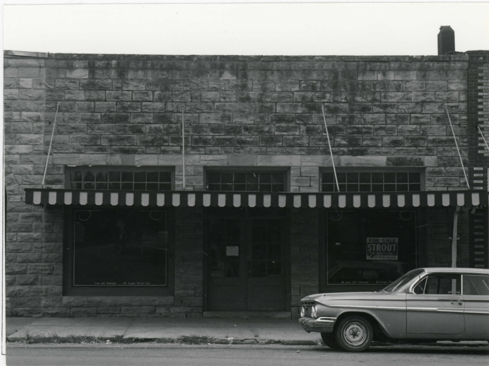
Historic Resources of Stone County Stegall General Store, ST-102 Mountain View 1983 Negative on file at the AHPP Viewed from the north