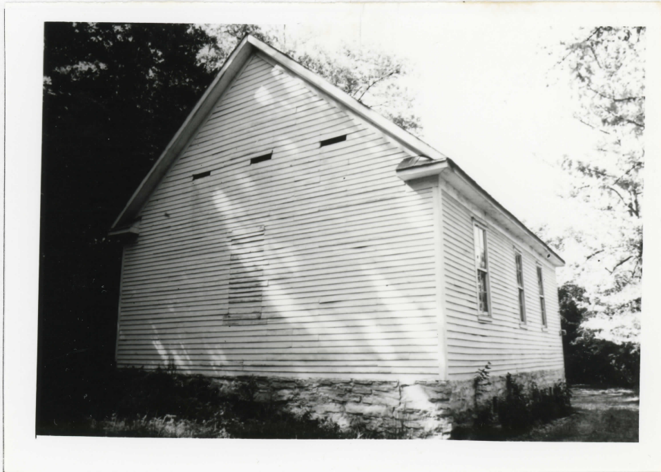
Historic Resources of Stone County Roasting Ear Church & School, ST-185 Onia vicinity 1983 Negative on file at the AHPP Viewed from the southeast