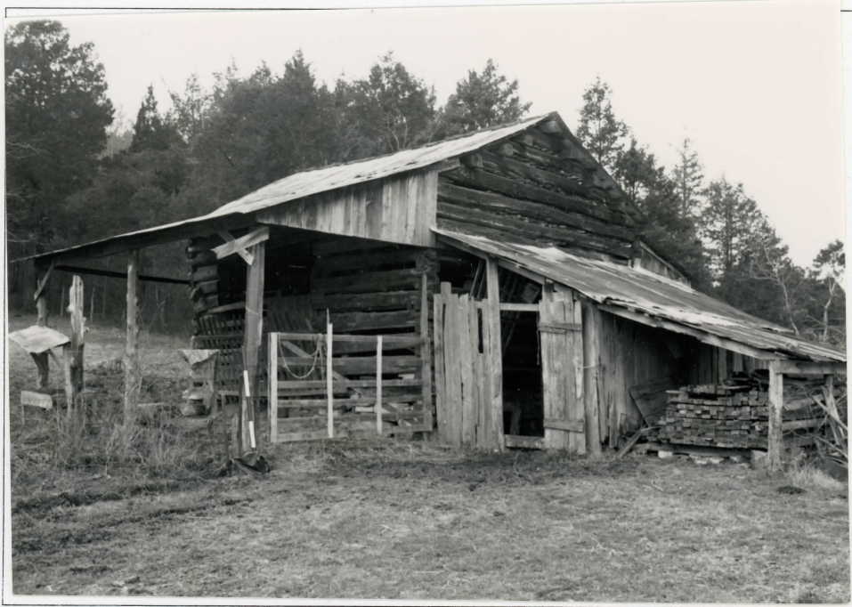
Historic Resources of Stone County William Dillard Homestead, ST-128 Round Bottom Viewed from the southeast