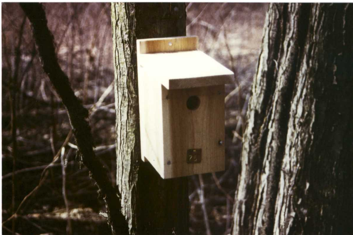
Figure 30. One of the 100 prothonotary warbler nest boxes built by DuPont and donated to the Cooperative FWS/DNR/DuPont program. (JB)