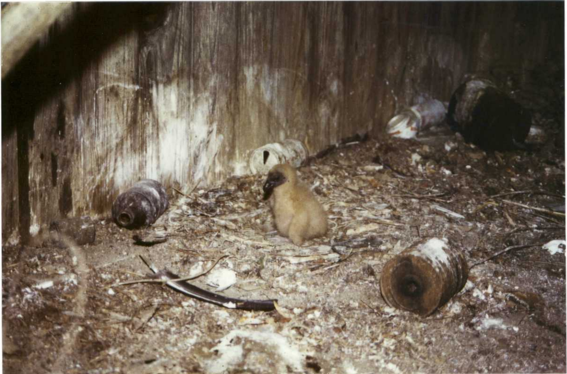
Figure 23. A rare sighting, newly hatched black vulture chicks were raised to fledging in an old shed on Manchester Island #2. (PM)