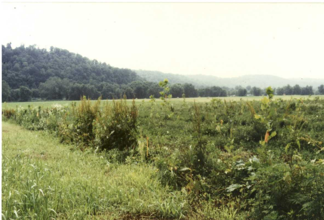
Figure 20. These tree plots are part of the refuge's efforts to restore bottomland hardwoods to Middle Island. (BP)