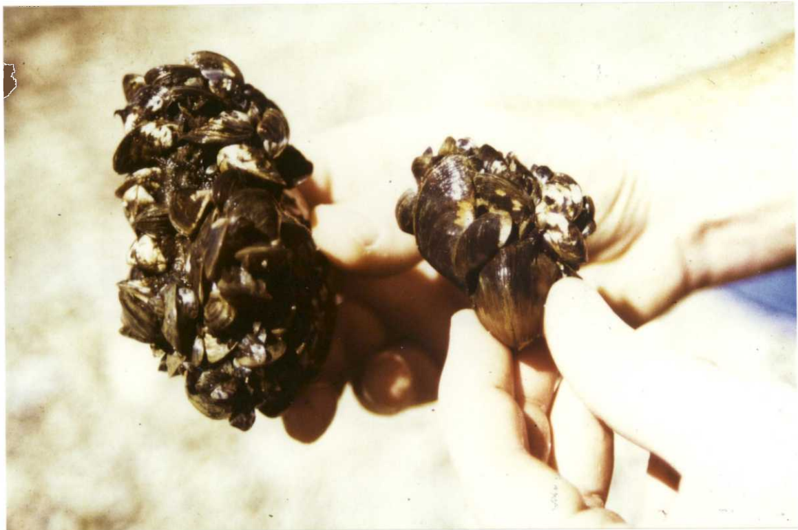
Figure 34. Our first good look at severe infestation by zebra mussels, at Aurora, IN. (PM)