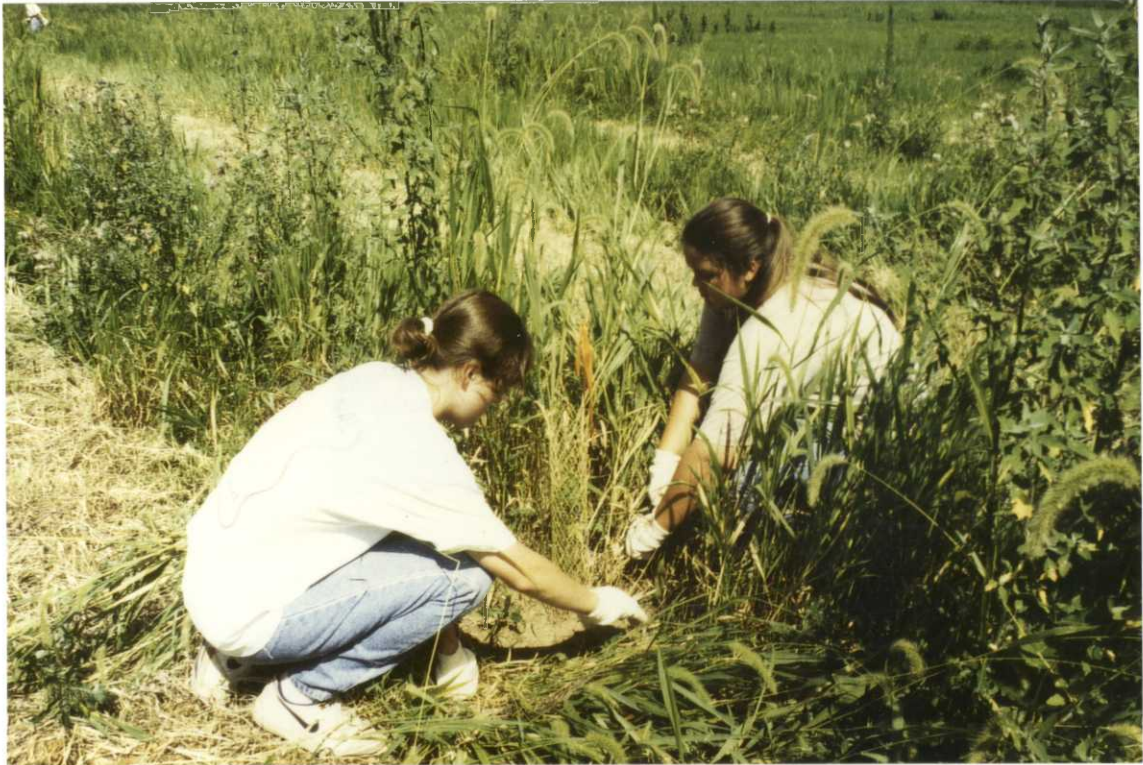
Figure 9. Scout groups and 4-H Clubs from West Virginia planted the Kentucky trees as well as trees collected in West Virginia on Middle Island. (JB)