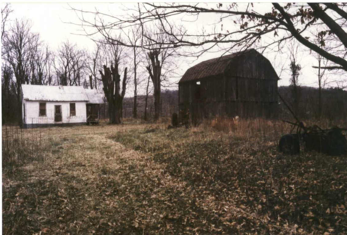
Figure 54. Buildings on Buffington Island which were focus of cleanup efforts on April 13, 1995. Contents of these buildings were removed by the prior landowner as part of the cleanup. (ME)