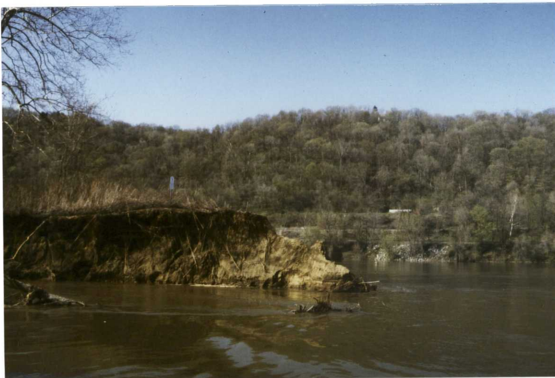
Figure 17. Georgetown Island in Pennsylvania, showing effects of serious erosion near the head of the island. (ME)