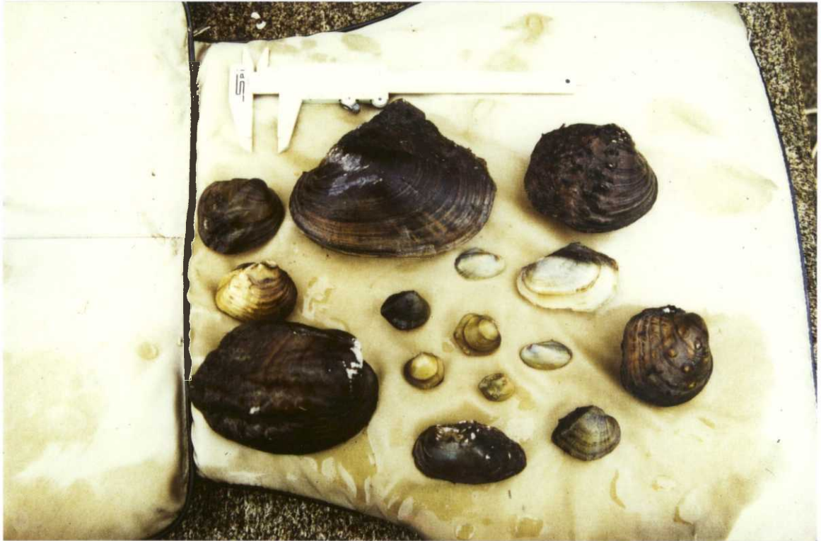
Figure 33. Freshwater mussel diversity at Aurora, IN, one of the four zebra mussel monitoring sites sampled by refuge staff in 1995. (PM)