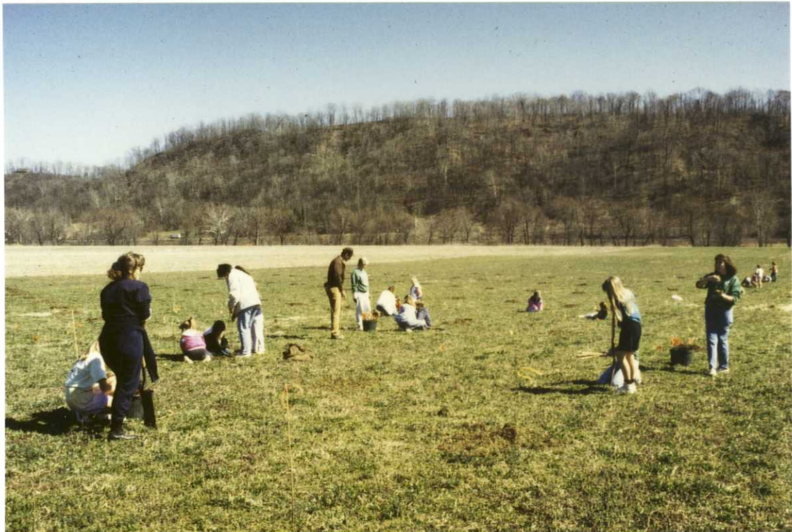
Figure 10. Ohio Students hand-weeded one of the tree plots on a scorching July day.