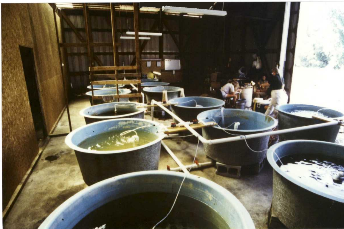
Figure 39. Experimental mussel quarantine facility constructed in an enclosed barn on Middle Island.

and inspecting the mussels after their mandatory quarantine period to ensure that they were zebra free.