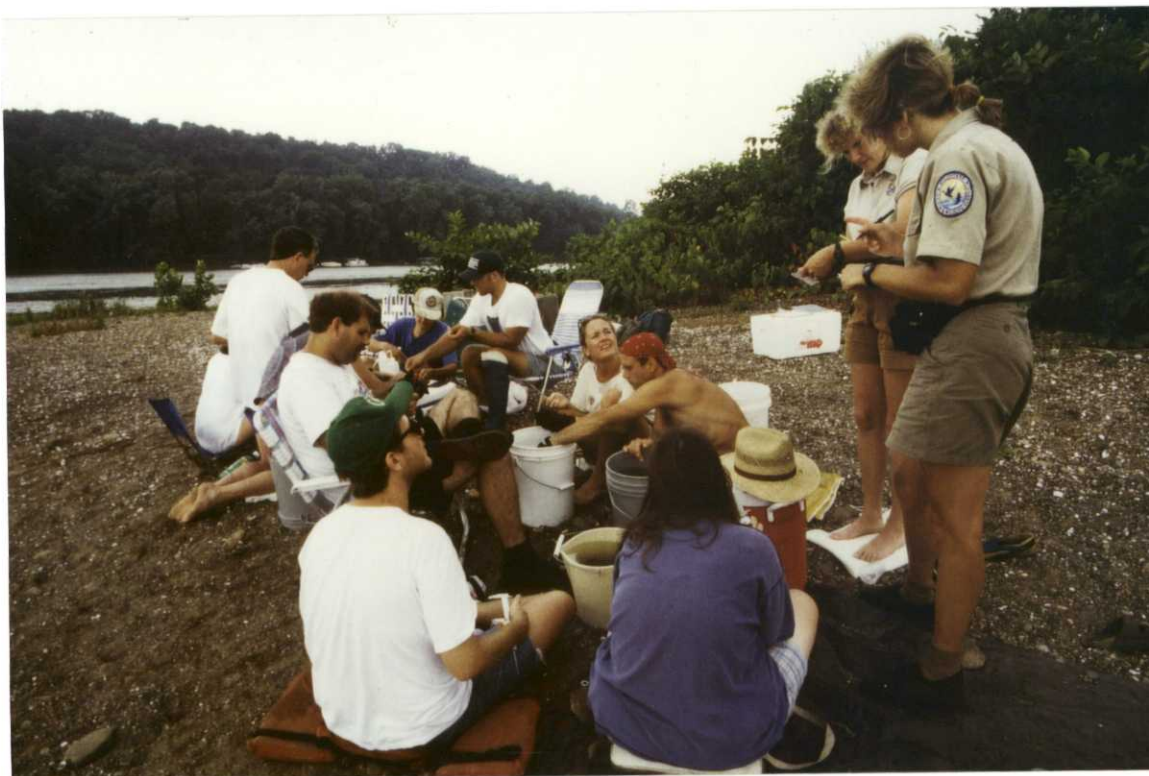
Figure 42. Assembly line of mussel processors. Mussels are measured, weighed, and tagged for longterm captive rearing studies. (JB)