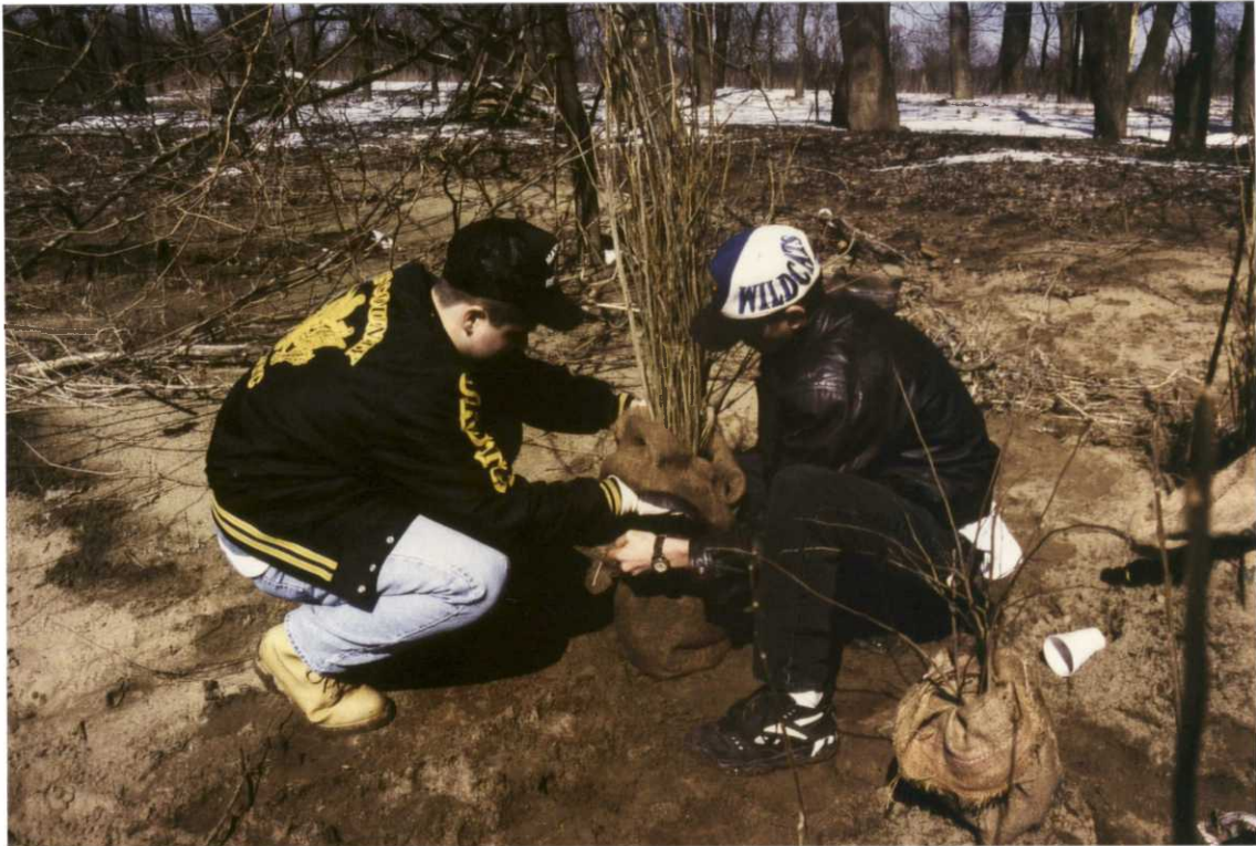
Figure 8. Volunteers from three states helped with the refuge's first reforestation efforts in 1995. Students from Kentucky harvested over 1000 trees on refuge property in that state. (JB)

The refuge volunteer program saw a substantial increase in the number of volunteers involved in refuge activities in 1995. One-hundred-sixty-eight volunteers contributed 2095 hours to the refuge compared to 40 volunteers contributing 1177 hours the previous year. The increase in number of volunteers was in part due to the acquisition of Middle Island whose bridge provide automobile access to the refuge. The reforestation project on Middle Island contributed to the large increase in volunteer numbers with many groups and schools involved in the project.