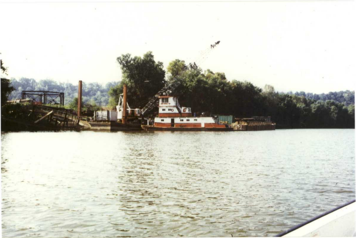
Figure 13. Illegal barge loading activity in the backchannel of Muskingum Island. (PM)