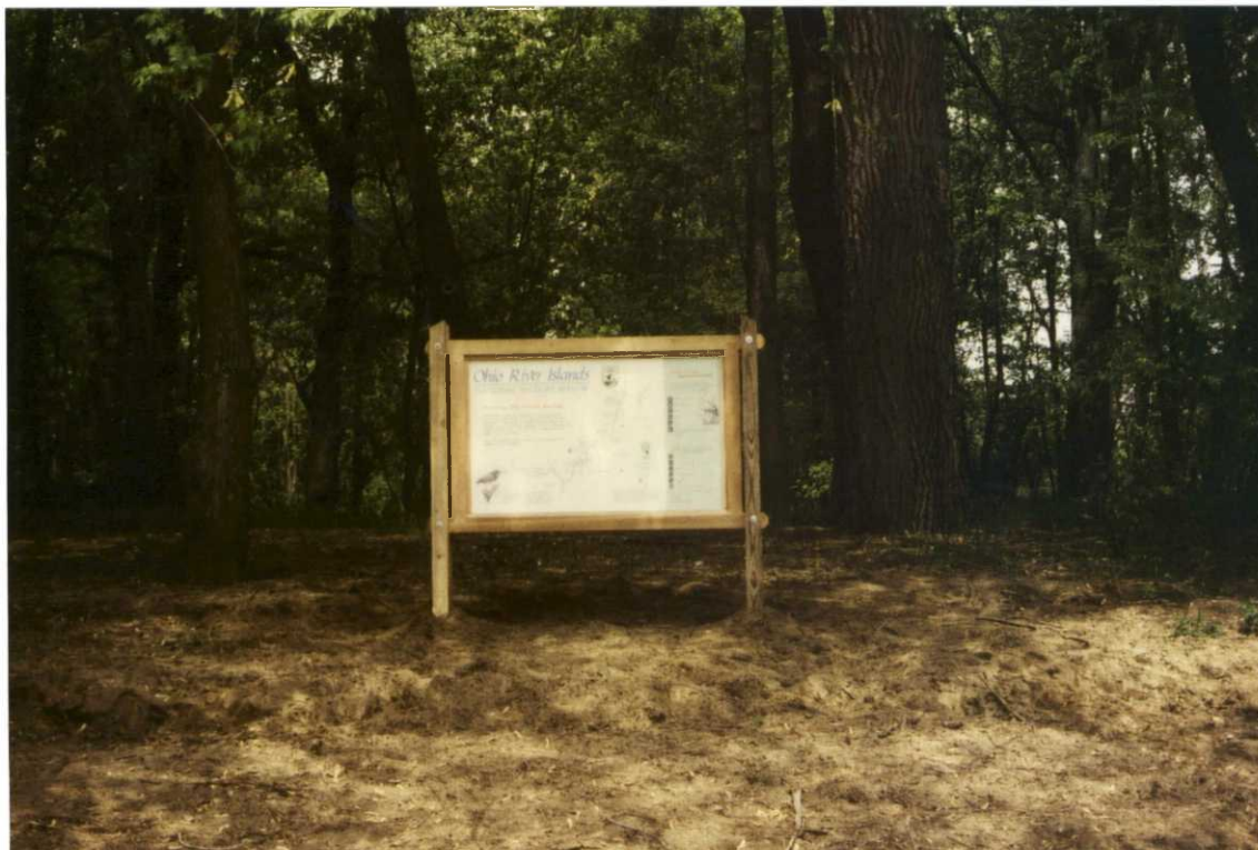
Figure 46. One of five identical kiosks installed on refuge islands this year. (JB)

By the end of the recreational use season, the kiosks varied in physical condition. The Williamson Island kiosk disappeared completely early in the summer, presumably due to vandals. The frame was recovered at a downstream riverbank after the refuge issued a news release requesting information about the kiosk. Vandals destroyed the plexiglass on the Middle Island kiosk, though did not bother its replacement. Nature proved to be the vandal of the Manchester 2 kiosk; a late spring high water event completely lifted the kiosk from the beach and redeposited it, muddied but undamaged, 200' inland. Kiosks on Phillis and Grape Islands received no damage throughout the season.