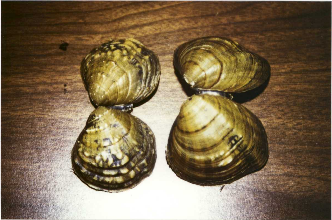
Figure 25. Two specimens of the endangered Cyprogenia stegaria , collected from a muskrat midden on Middle Island. (PM)