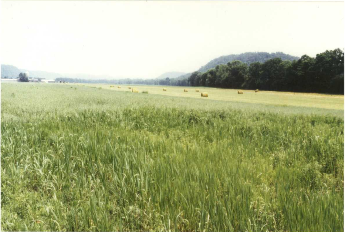
Figure 21. Hayfields on Middle Island were established to control exotic weeds until reforestation efforts could be implemented at those sites. (BP)

The farmer was also able to harvest alfalfa from two small fields this year. However, these areas are not being maintained for alfalfa and eventually will be overplanted with native grasses.