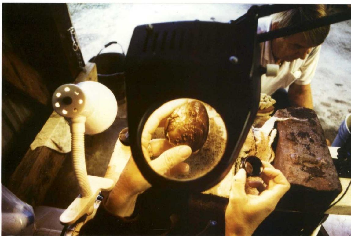
Figure 40. Native mussels are examined after a 30-day quarantine period to insure they are free of zebra mussels. (PM)