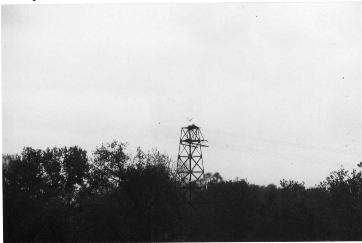
Figure 27. Osprey nest on Neal Island, WV, was later abandoned and no young were produced. (PM)

At the toe of Neal Island, on top of a powerline tower owned by the City of Parkersburg, a pair of osprey were observed successfully constructing a nest and mating on many occasions, but an overflight by a private pilot in July revealed that there were no young in the nest. It is unclear whether the osprey indeed laid eggs or hatched any young, but they appeared to have been incubating continuously for weeks. It is possible that a great horned owl or other predator may have disrupted the nest.