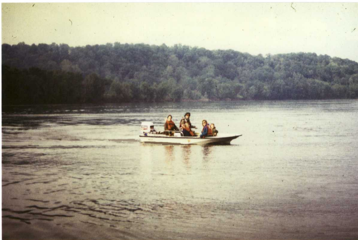
Figure 22. Local birders en-route to Muskingum Island for the International Migratory Bird Day Survey. (PM)

Due to the three-week furlough in December, refuge staff were unable to conduct the Ohio River portion of the Christmas Bird Count.