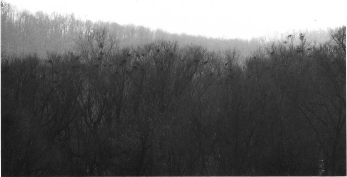
Figure 26 . The Grape Island rookery in winter. Some herons stake out their territory early. (PM)