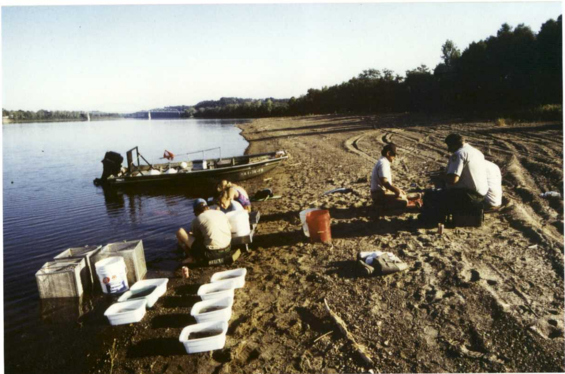
Figure 36. Onshore processing of mussel samples at Hawesville, KY zebra mussel monitoring site. (PM)