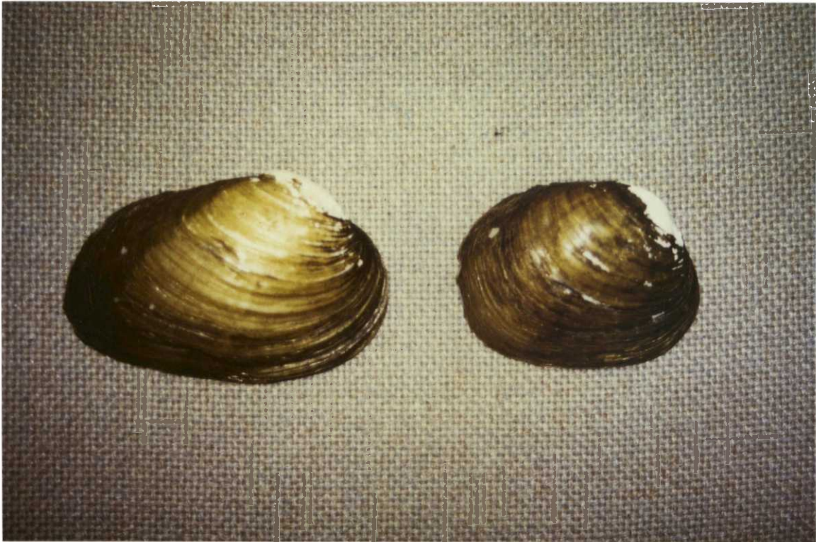
Figure 38. Refuge museum specimens of male and female Lampsilis abrupta , one of nine species of endangered mollusks which occur in the mainstem Ohio River. (JB)

are at risk from zebra mussels. State cooperators, including refuge staff, helped draft a protocol for the handling, transport, and quarantine of salvaged endangered mussels, and identified facilities basinwide which are now approved as quarantine and long-term holding sites. During the 1995 field season, one male Lampsilis abrupta was collected.