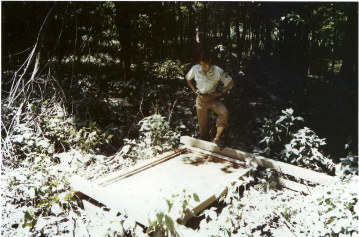
Figure 1. June floodwaters moved our new kiosk over 200 feet, but we found it. (ME)

The unusual June flooding transported one of the refuge kiosks on Manchester Island (it was recovered and placed at a higher elevation). It was later determined by refuge divers that the June flood had a marked impact on zebra mussels--the scouring of the bottom and deposition of sand and gravel by floodwaters may actually have stripped zebra mussels off the bottom (leaving the byssal threads attached) and interfered with a reproductive class. This is potentially an important control mechanism for zebra mussels in an open system.