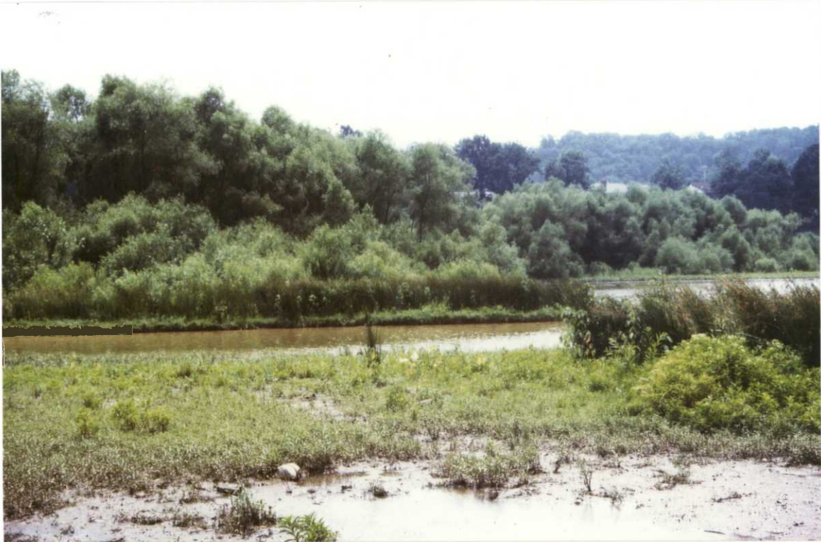
Figure 14. Wetland habitat diversity in the Sandy Creek Embayment. (PM)

The botanists and ecologists spent the rest of the summer and fall visiting major embayments and wetlands along the Ohio River Corridor, and can provide valuable information documenting the significance of these wetland habitats.