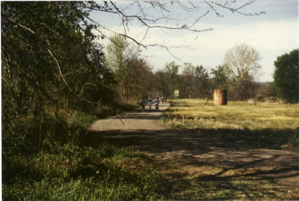
Figure 45. The refuge reported its first sighting of joggers on the refuge this year. Middle Island came with a road in addition to its bridge. (ME)

Another "first" came to the refuge in 1995 with the installation of five information kiosks. Six 3'x 5' fiberglass embedment panels were fabricated by Wilderness Graphics at cost of approximately $1030 each, including frame, scratch resistant plexiglass, hardware and mounting posts. Reserving one complete kiosk for a spare, the others were placed on islands receiving the majority of public use: Phillis Island in PA, Williamson, Grape, and Middle Islands in WV, and Manchester 2 Island in KY. Except for Middle Island, all kiosks were placed on beach areas and removed for the off-season months.