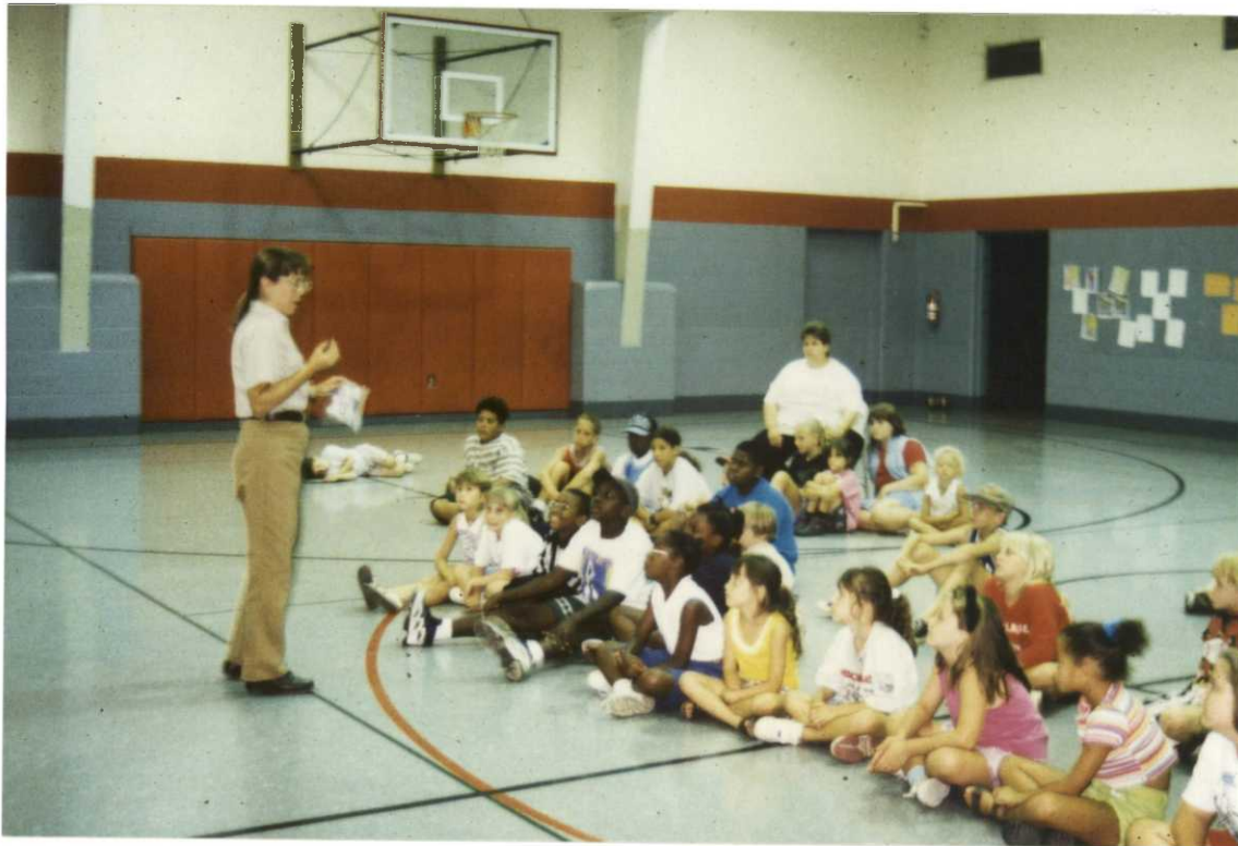
Figure 50. Wood County, West Virginia offered an Environmental Day Camp in 1995 in which the refuge participated. (CC)