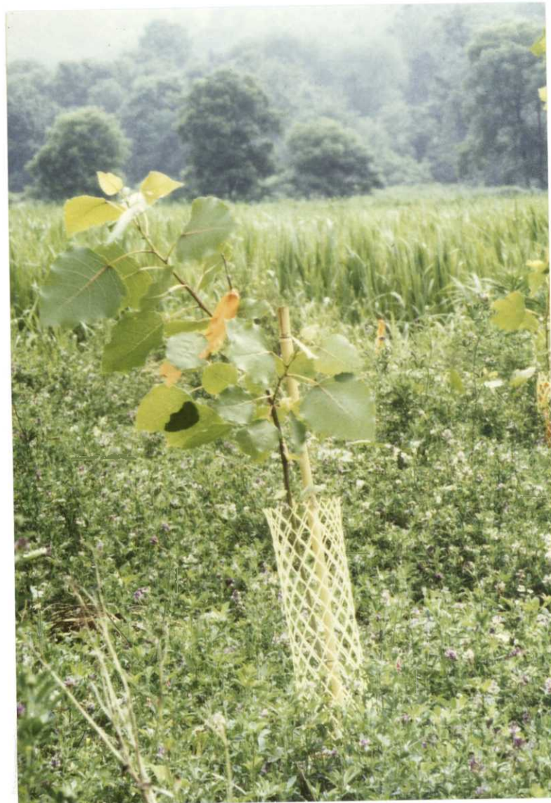
Figure 19. Cottonwood seedling planted by volunteer on Middle Island. (JB)