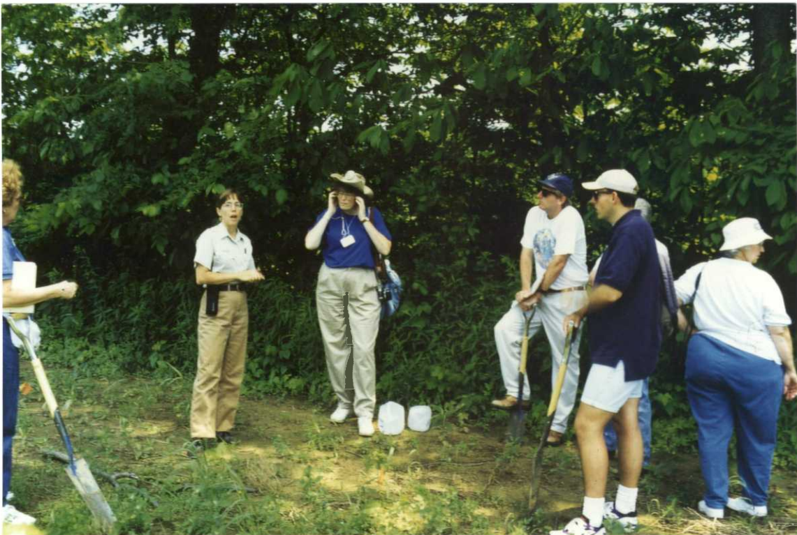
Figure 47. ORP Butler gives instructions to teachers participating in a workshop on Middle Island. (CC)

The refuge hosted one on-site teachers' workshop in 1995. Twenty-four teachers from Wood County attended the workshop on Middle Island, a repeat group from the previous year. Activities were developed to compliment the reforestation project on the island. Because Middle Island will be the site of most future workshops, plans are to eventually create a curriculum covering a range of concepts that will allow teachers to choose those most relevant to their teaching needs. See section 7. "Other Interpretive Programs" for additional information about teacher workshops.