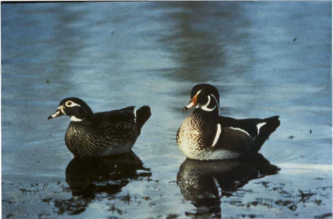
Figure 43. Refuge volunteers band wood ducks to contribute to the Office of Migratory Bird Management Wood Duck Population Initiative. (BT)

wood duck banding program, and the first year that they executed it completely on their own.