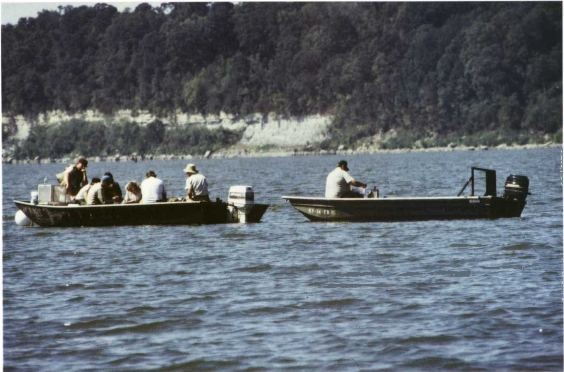
Figure 35. Eight biologists from 3 FWS Offices and 2 state fisheries offices process mussel samples onboard during zebra mussel monitoring. (PM)