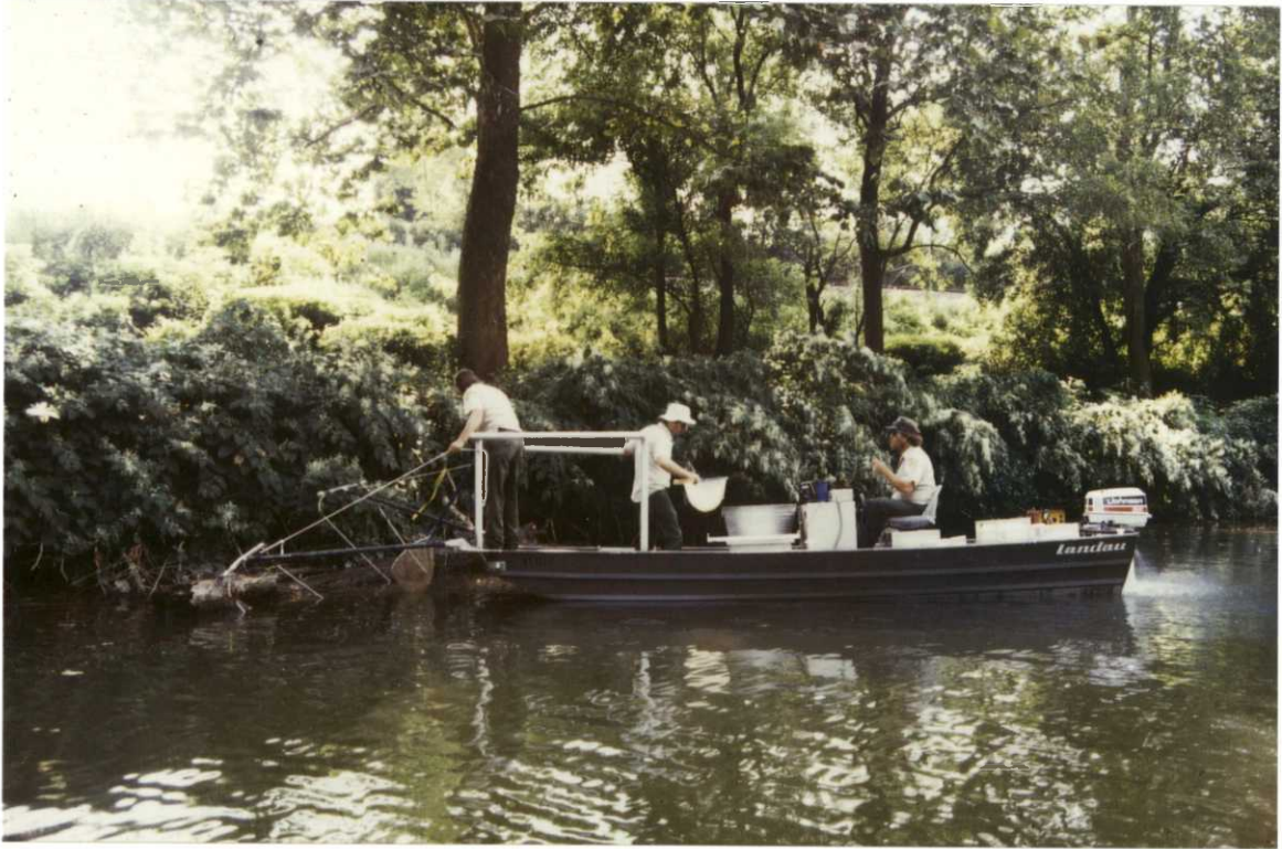
Figure 15. WVDNR fisheries biologists conducted boat electrofishing surveys in selected island backchannels in 1995. (PM)