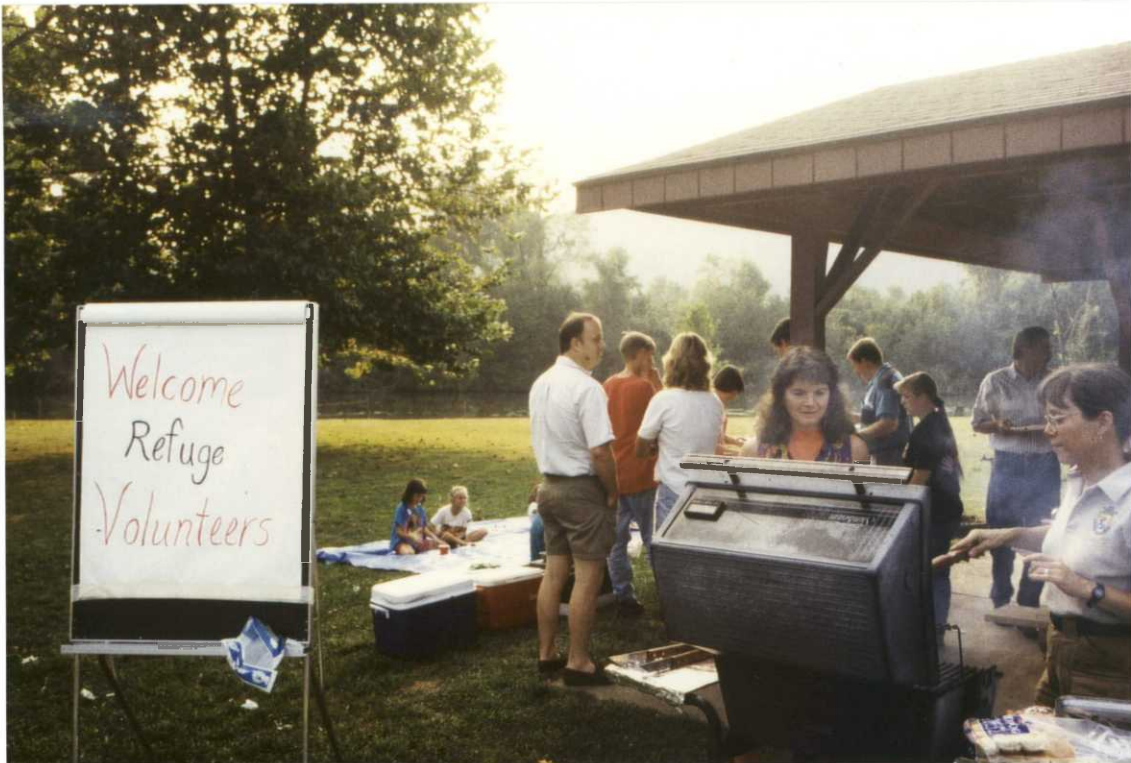
Figure 11. Our refuge volunteer picnic took place at the end of August, a good way to end a summer of excellent volunteer support. (BB)

The refuge held its first Volunteer Appreciation picnic this year, using the picnic facilities at the St. Marys public marina adjacent to Middle Island. Refuge staff prepared the food, attended by approximately 50 volunteers. Volunteers were introduced and presented with certificates of appreciation.