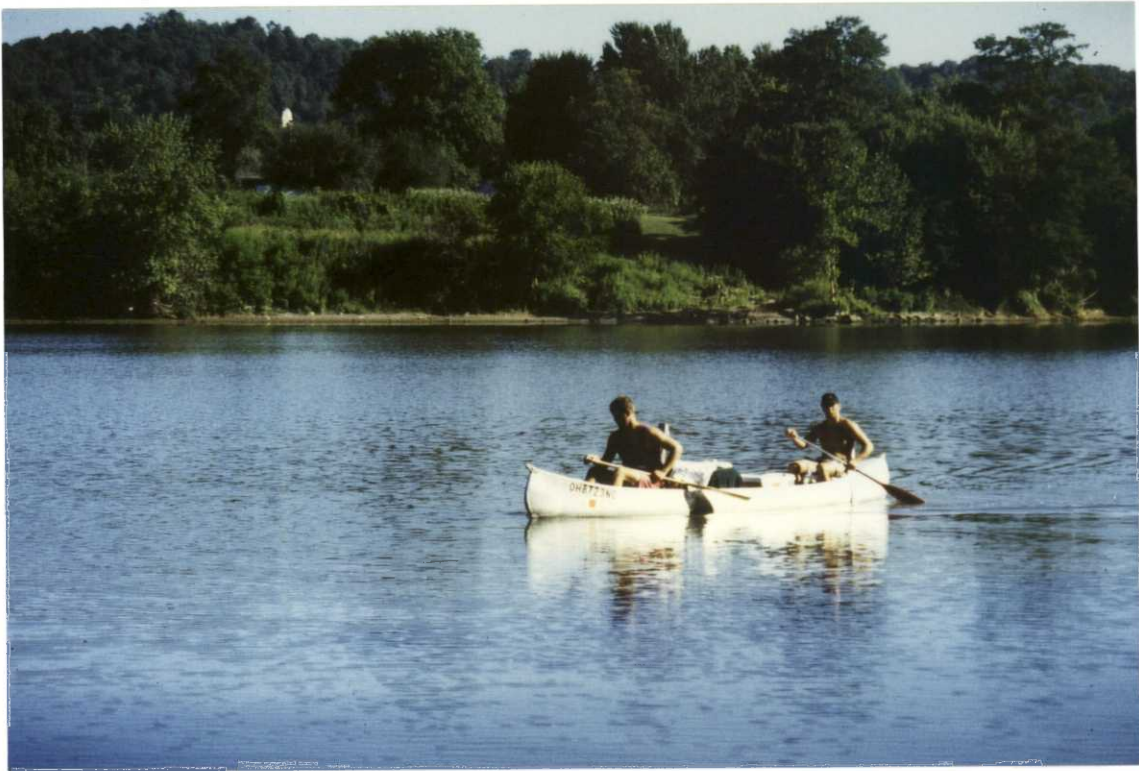
Figure 52. The Ohio River isn't just for barges and jet skis. Island backchannels occasionally attract canoeists.

Refuge public use data collection in 1995 was insufficient to construct island-by-island use summaries. Some islands were visited fairly often because of other refuge work, while others were documented only once during the recreation season. Table 11 lists estimates of use based on extrapolations of public use inventories, undocumented observations and reports, and comparisons to past use levels.