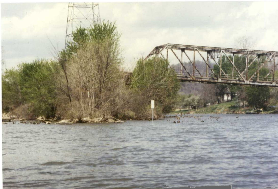
Figure 44. It doesn't look like much, but the bridge to Middle Island allowed for an expansion in our public use and volunteer programs. Public access to the refuge is no longer limited to boats. (ME)

In addition to the bridge to the island, another novel feature of Middle Island is its road--the only one on the refuge. Following the main channel edge of the island, the dirt and gravel road traverses the two-mile length of the island. The road introduced recreational activities not previously seen on the refuge, including bicycling, jogging, fitness walking, and automobile touring. Some potential user conflicts emerged with the complaint of dust annoyance caused by motorized vehicles. Options including partial road closure and trail development will be considered in future planning for recreational use on the island.