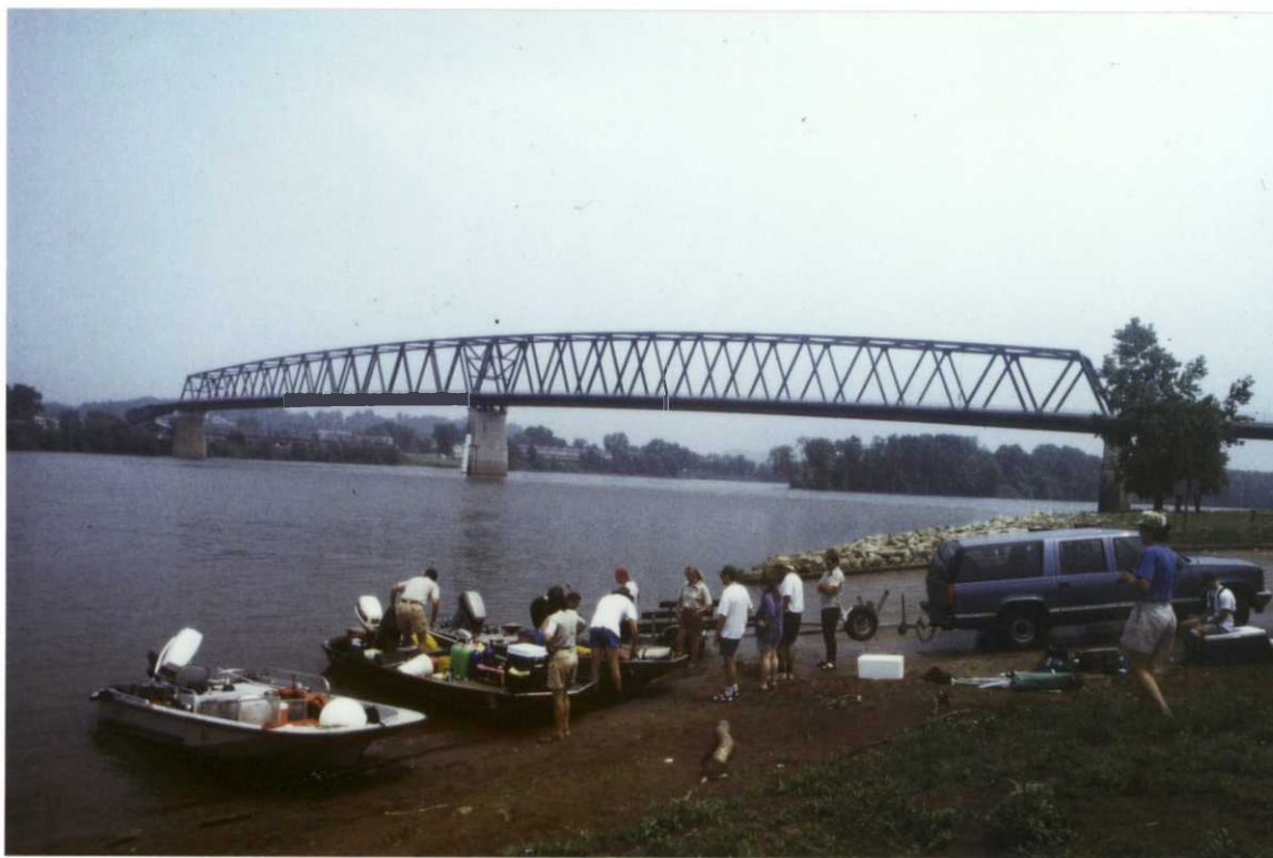
Figure 41. Cooperative effort is launched to collect specimens of big river mussel species for captive rearing studies. (JB)

From July through October, refuge divers cooperated with NBS/Virginia Polytechnic Institute Cooperative Fisheries Unit Researchers, State of West Virginia DNR, West Virginia DEP, White Sulphur Springs National Fish Hatchery, Elkins ES, and other volunteers in a major effort to collect eight species of big river freshwater mussels for captive rearing studies at the Leetown Aquatic Ecology Laboratory and White Sulphur Springs National Fish Hatchery. Over 20 people were involved in the collection and processing of specimens. Each one of the animals had to be scrubbed, tagged, measured, aged, and segregated by sex and gravity prior to transport to the quarantine facility on Middle Island. In addition to the eight species collected for the captive rearing studies, divers collected approximately 20 individuals of Plethobasus cyphus , the sheepsnose mussel, a species under consideration for candidate status. These individuals were collected under the newly approved salvage permit for threatened and endangered mussels and other species of special concern in the Ohio River mainstem and tributaries. Some of these animals will be housed at Leetown, and others at White Sulphur Springs National Fish Hatchery.